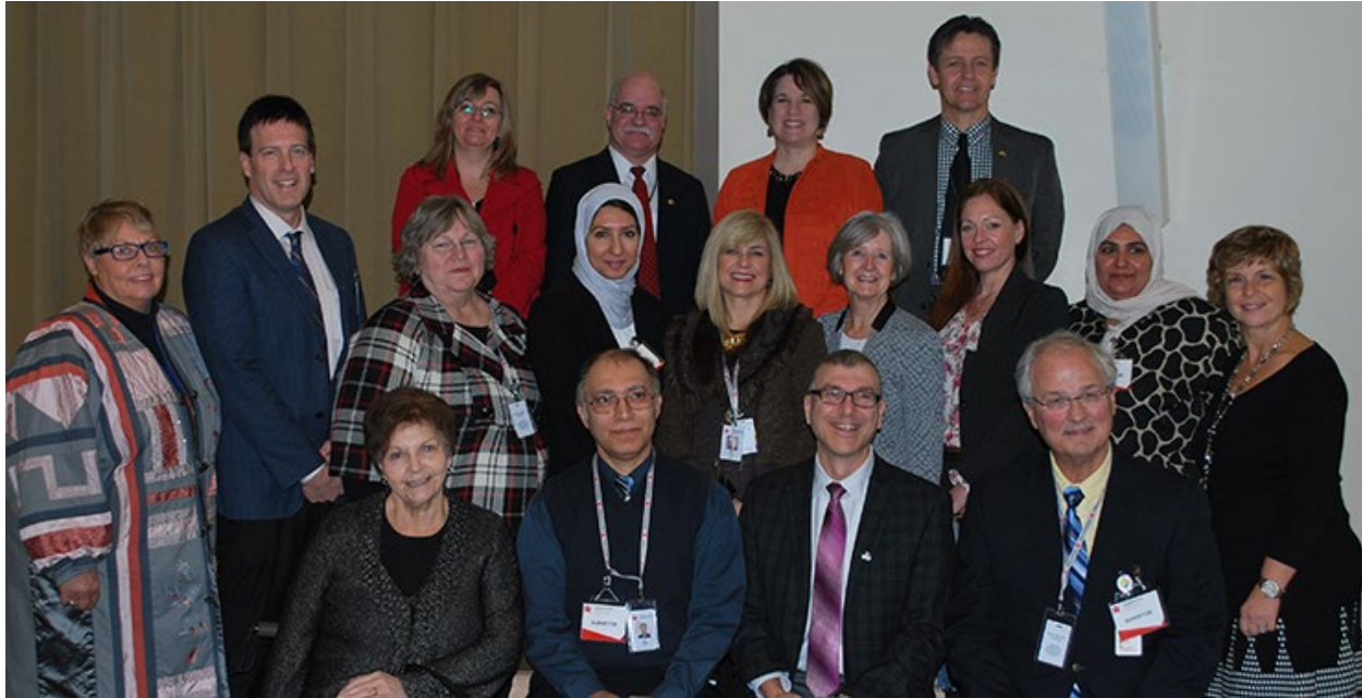
Members of the NBRHC Senior Team, Board Members together with the Accreditation Surveyors and the Guest Observers from Kuwait who joined us for the week.

The North Bay Regional Health Centre (NBRHC) is proud to announce that it has achieved 'Accreditation with Commendation' from Accreditation Canada. Accredited with Commendation is "for organizations that go beyond the requirements of Accreditation Canada and are commended for their commitment to quality improvement." To receive this score, NBRHC had to exceed a score of 95% on thousands of standards observed by the accreditors during the on-site survey completed in November 2015.